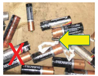
No metals, such as screws or paper clips