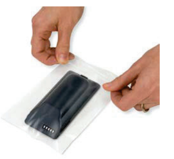
Gloves are recommended in high-volume environments.