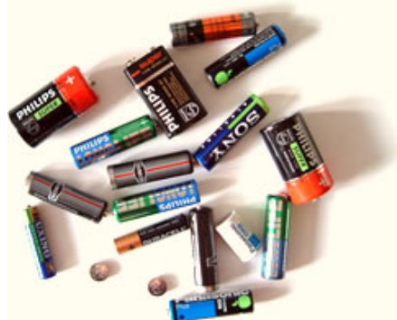
Household type batteries as dangerous goods.

While many types exist, not all batteries are subject to the Transportation of Dangerous Goods (TDG) Act and Regulations. For example, common household-type alkaline, nickel cadmium (NiCad), nickel metal hydride (NiMH), and silver-zinc batteries are not classified as dangerous goods. Even some small lithium batteries, depending on the amount of lithium they contain, may also be exempt from the TDG Regulations. Although when batteries are shipped by air, they will have more requirements or even some restrictions. For example, even household type batteries must have the terminals protected from short-circuit.